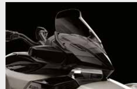
SPORT WINDSHIELD: Provides protection from the wind for improved comfort on the road.