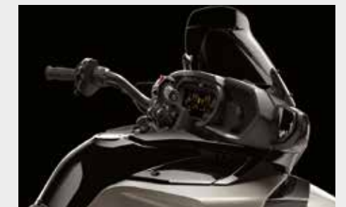
BRP AUDIO: Our 4-speaker sound system comes equipped with radio, USB, Bluetooth® and 1/8" (3.5 mm) audio inputs so you can listen to your favourite music from any device.