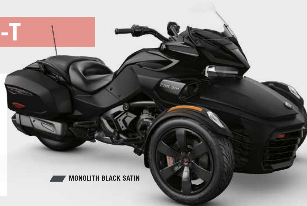
MONOLITH BLACK SATIN