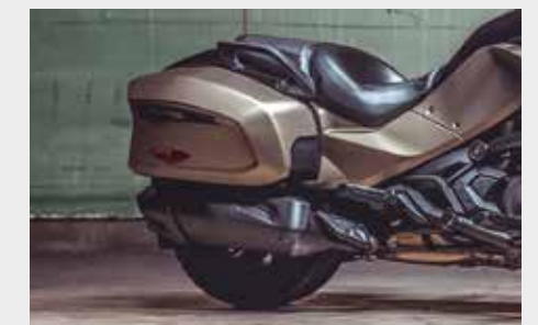
SADDLE BAGS: Integrated hard side luggage to allow you to take more with you on your adventure.