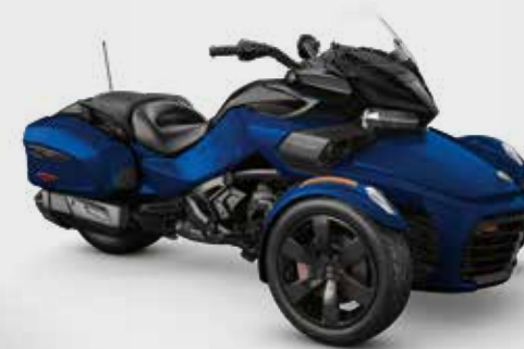
OXFORD BLUE METALLIC