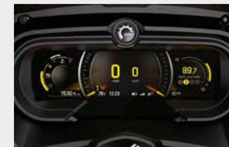
DIGITAL GAUGE: Large panoramic 7.8" wide LCD color display with BRP Connect™: allowing the integration of vehicle-optimized smartphone apps such as media, navigation and many others controlled through the handlebars.