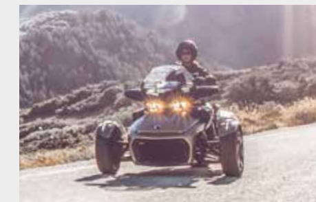
VSS: Vehicle Stability System that uses a variety of technologies, including SCS / ABS / TCS, to monitor the vehicle and keep the rider confident on the road.